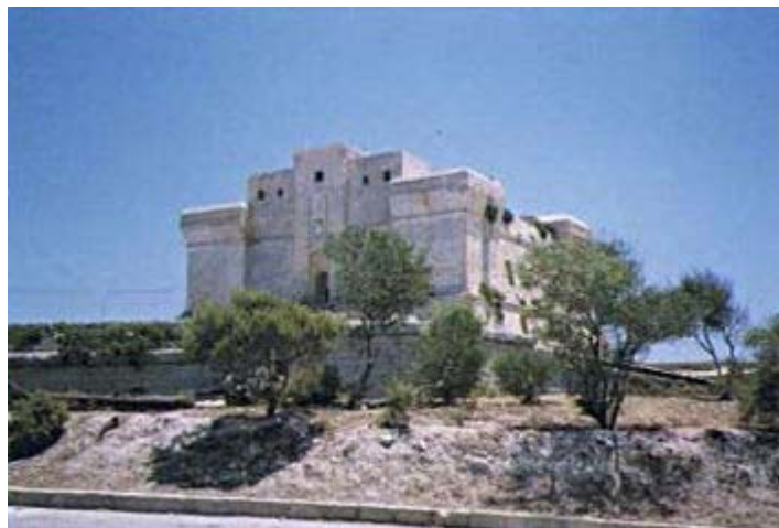
National Aquaculture Centre, Fort San Lucjan, Marsaxlokk