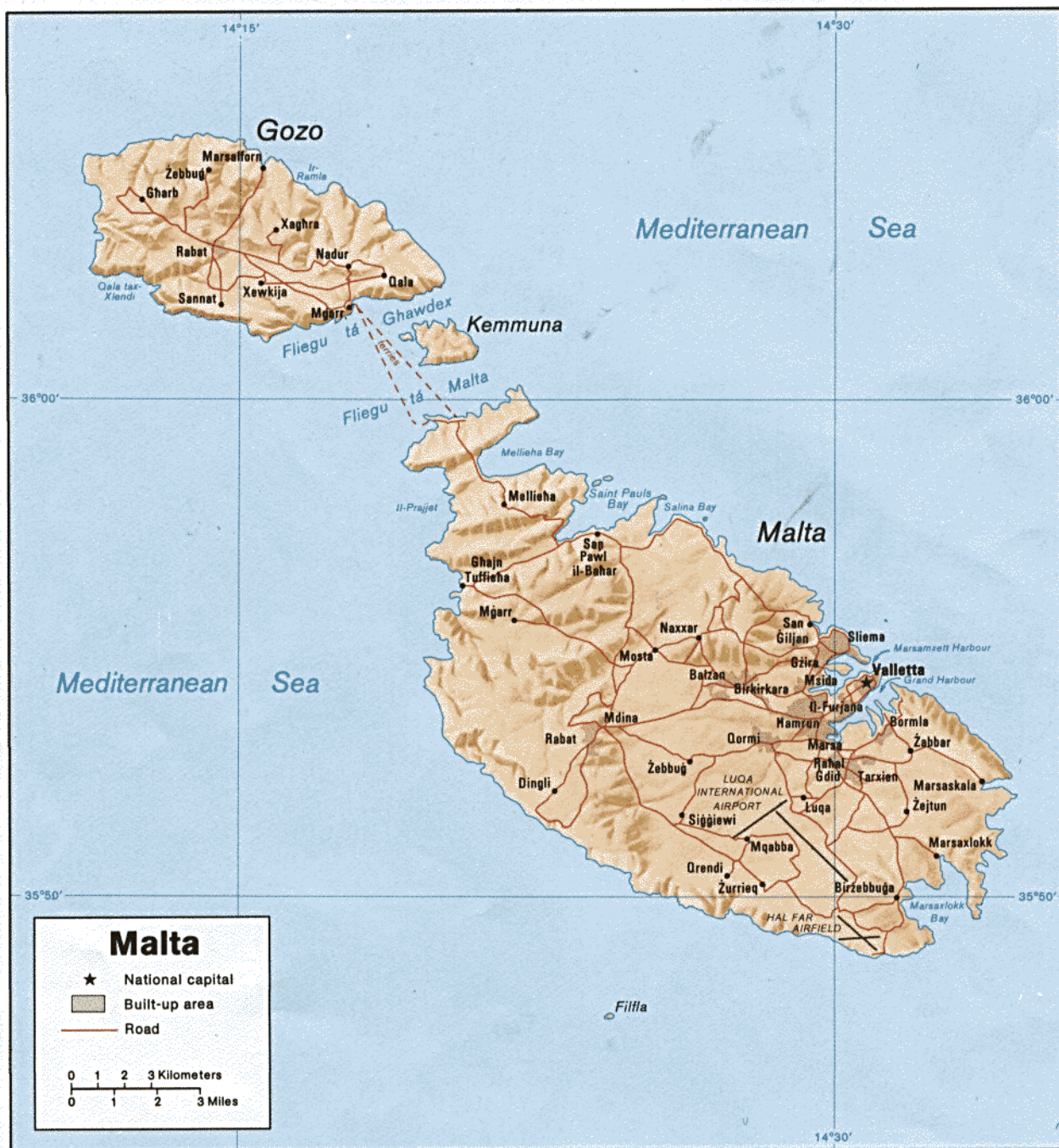
Figure 1 . General Map of Malta.