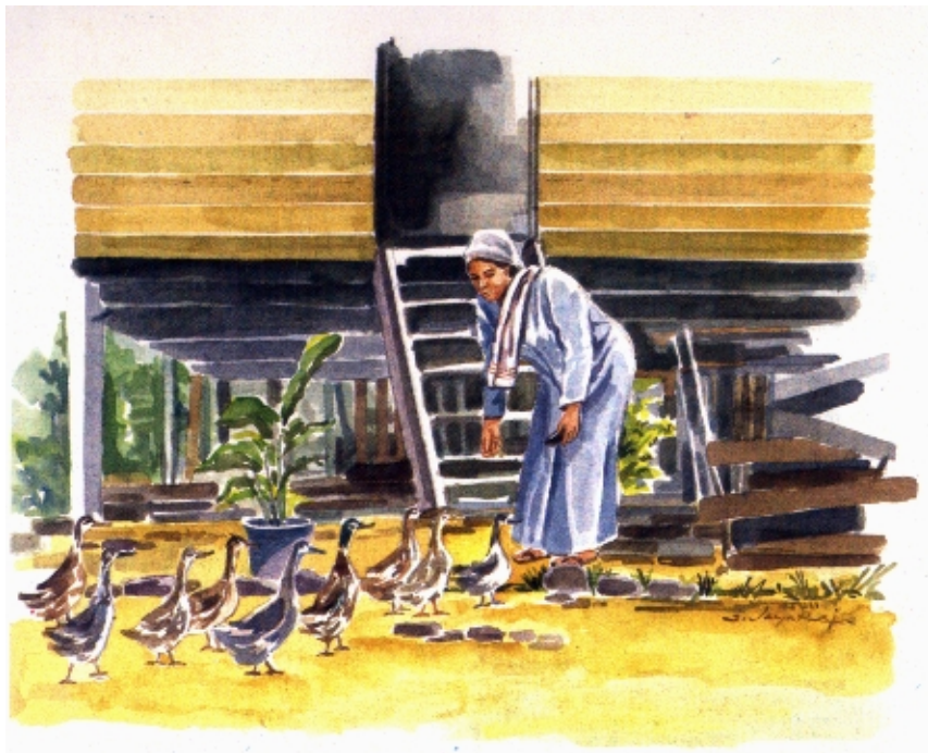
Duck-rearing by fisherfolk in Indonesia.