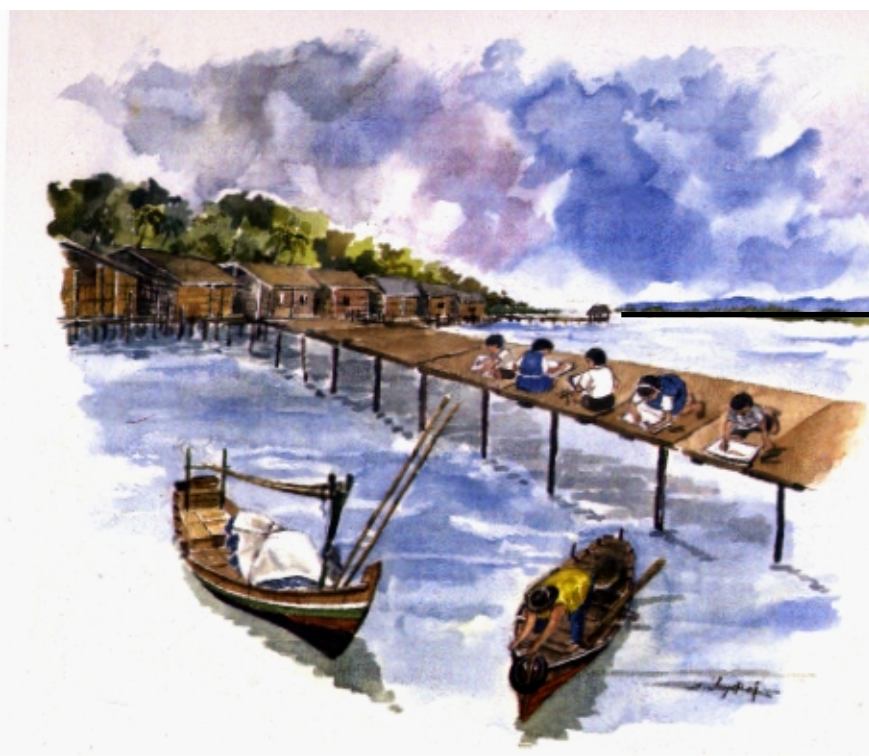
Painting competition in a fishing village in Malaysia.