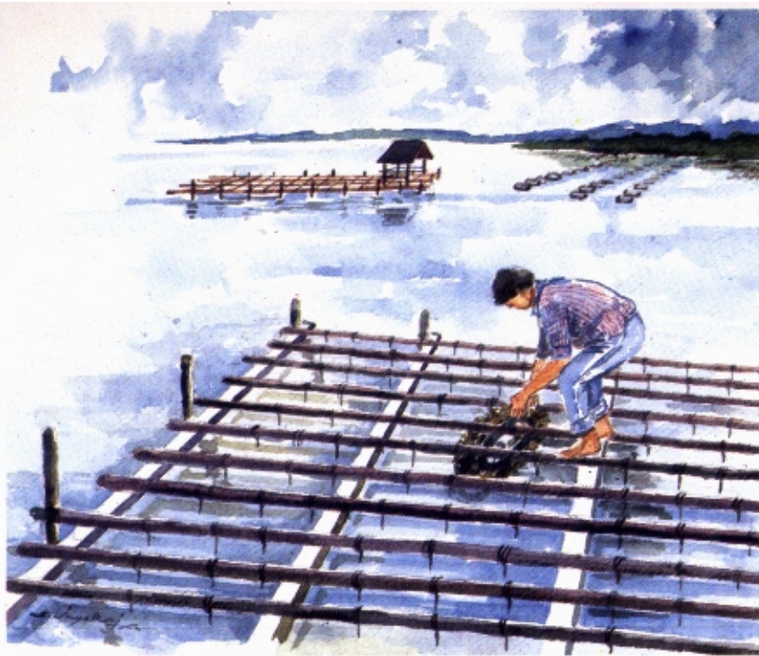
Oyster culture In Malaysia.