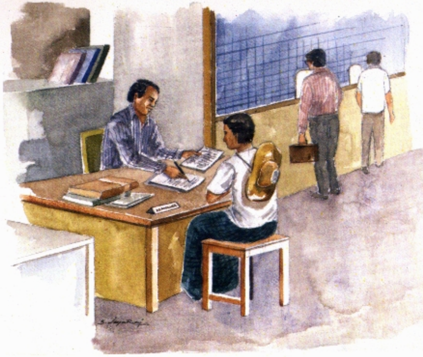
Credit schemes for fisherfolk in Sri Lanka