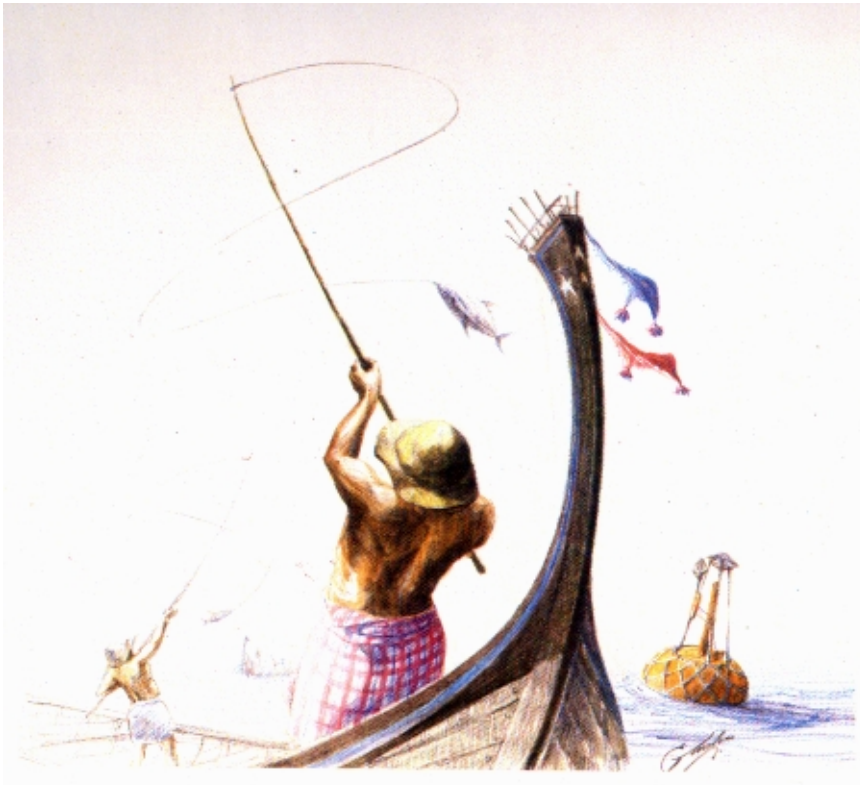
Fish aggregating devices In the Maldives.