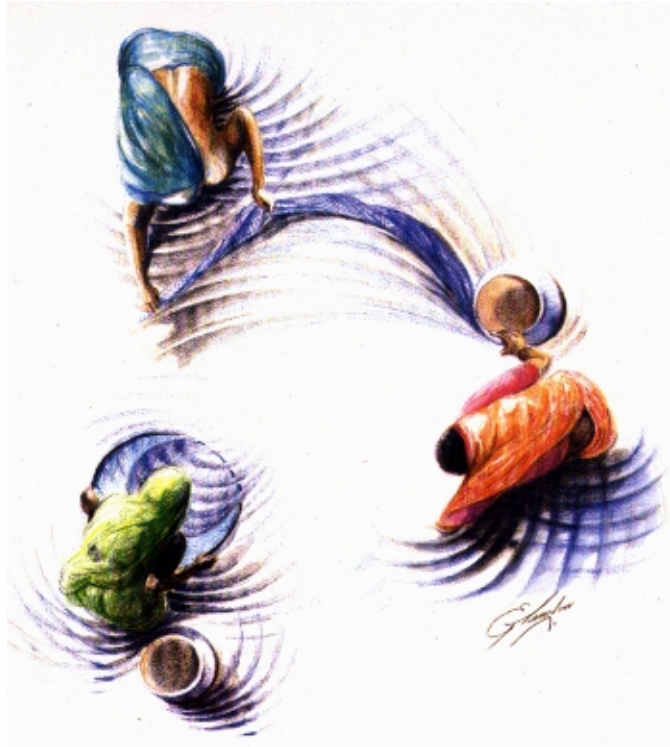
Shrimp fry-collecting in Bangladesh.