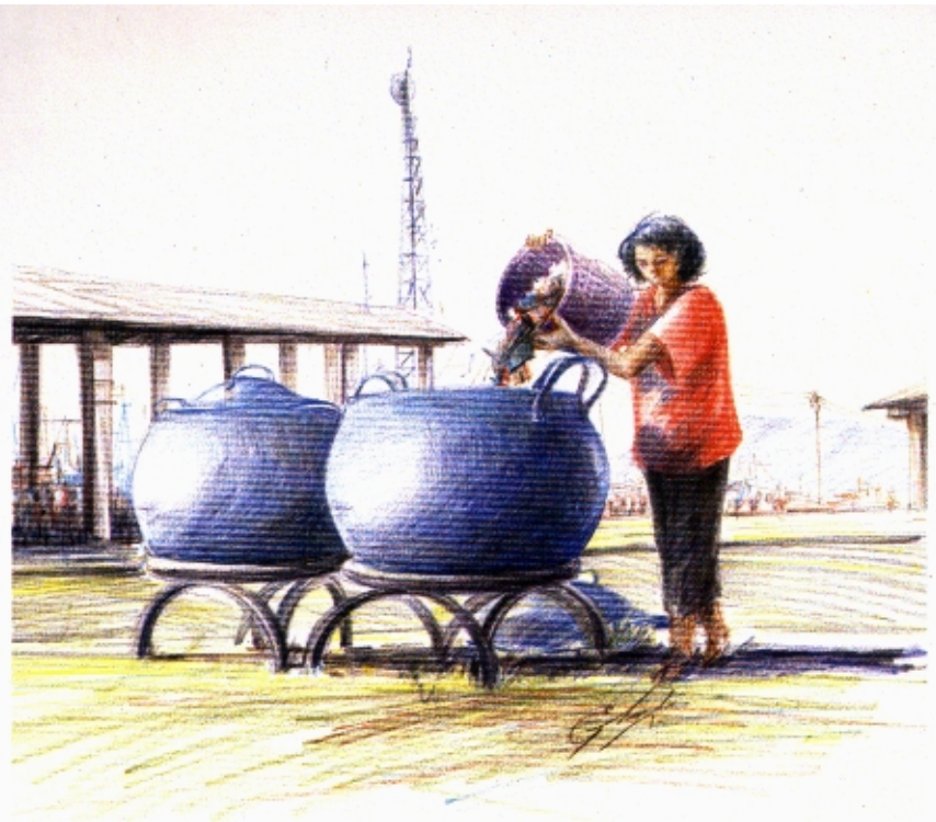
Cleaning up Phuket Harbour in Thailand.