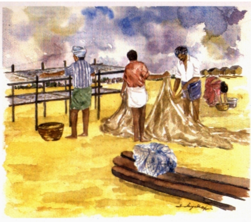
Rack-drying Anchovy in India.