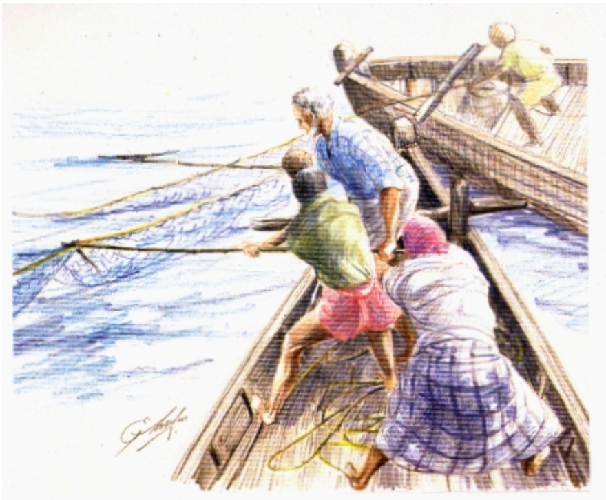
The set bagnet fishery in Bangladesh.