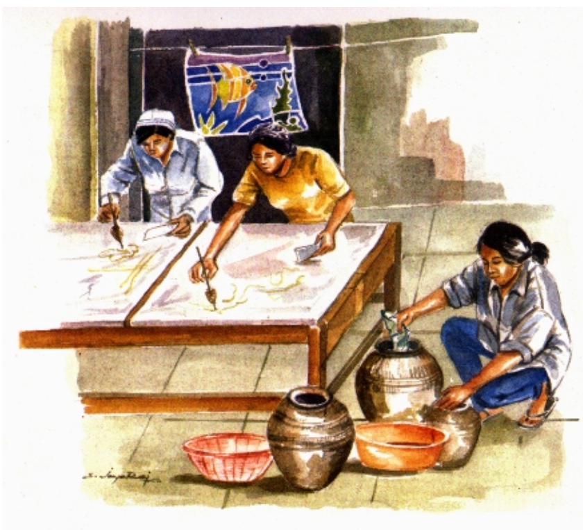
Batik-making In Thailand.