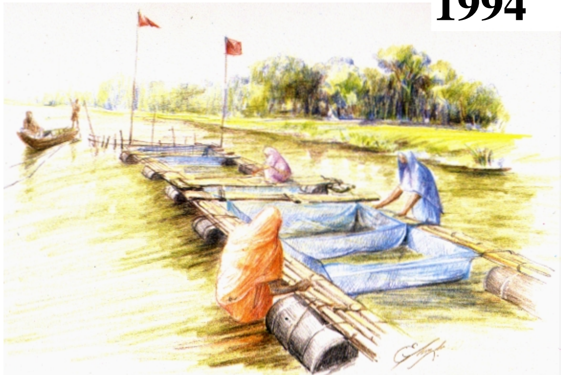
Nursery cage culture of shrimp in West Bengal, India.

The Bay of Bengal Programme (BOBP) is a multiagency regional fisheries programme which covers seven countries around the Bay of Bengal — Bangladesh, India, Indonesia, Malaysia, Maldives, Shri Lanka and Thailand. The Programme plays a catalytic and consultative role: it develops, demonstrates and promotes new technologies, methodologies and Ideas to help improve the conditions of small-scale fisherfolk communities In member countries. The BOBP is sponsored by the governments of Denmark, Sweden and the united Kingdom, and also by UNDP (anited Nations Development Programme). The main executing agency is the FAO (Food and Agriculture Organization of the United Nations).