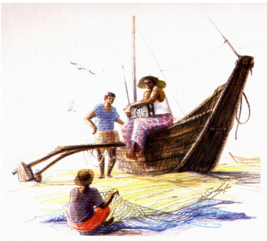
Fisheries radio programming in Shri Lanka.