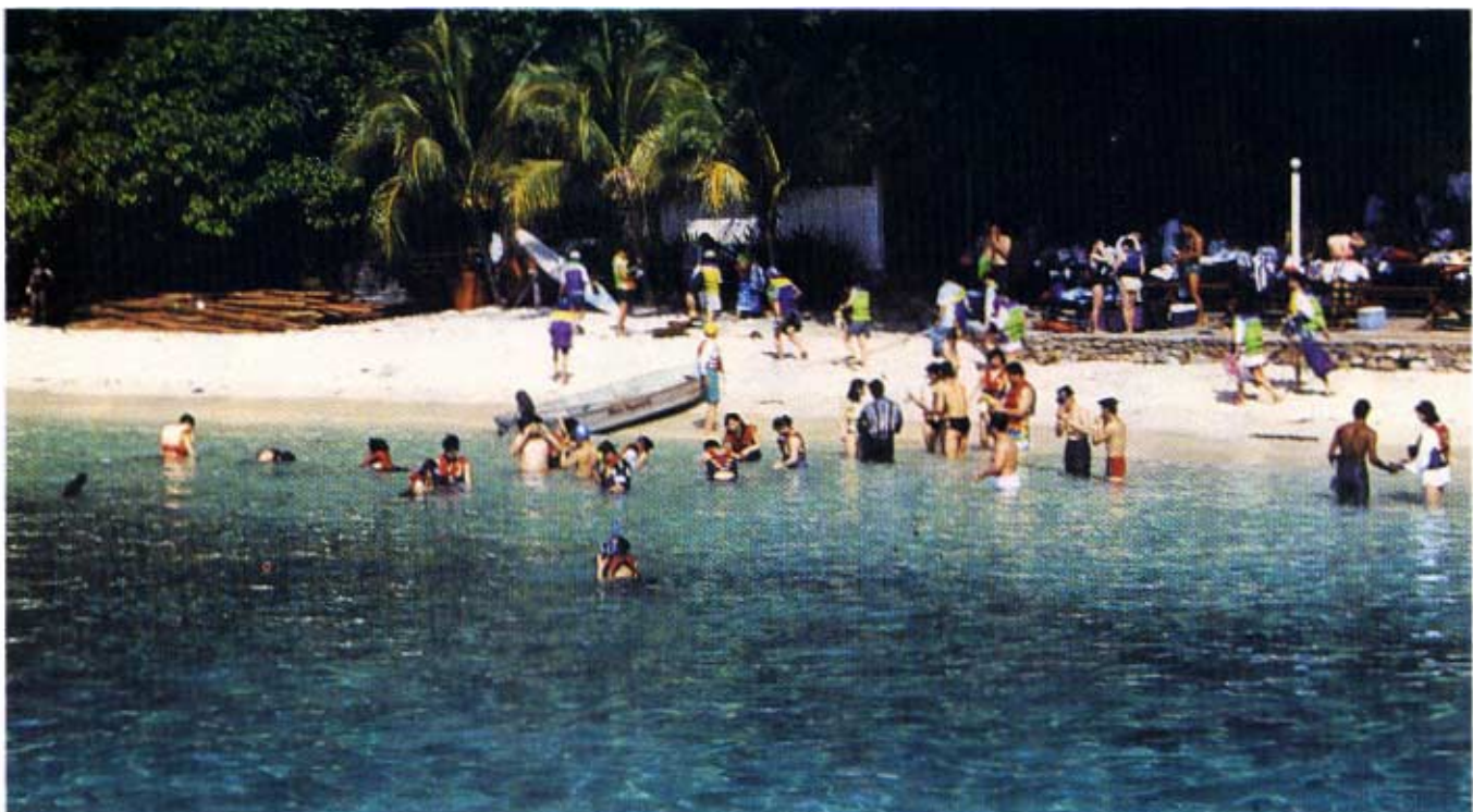
Visitors to Pulau Payar Marine Park, Malaysia, a marine resource sanctuary meant to protect the coral reef wealth of the area.

In Malaysia, the sectoral approach to planning has given way to a more multi-sectoral approach. As a result there is today an emerging trend towards a more integrated approach to fisheries management after years of training on the need for such an approach. Today, Malaysia has at least 2-3 generations of fisheries administrators and managers who have been exposed to Integrated Coastal Area Management (ICAM) work.