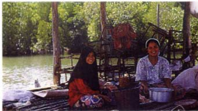
These two women from the fisherfolk community in Phang-Nga Bay are busy preparing barbecued chicken to supplement family income.

38 kg/hour in 1988. Much of this recovery can be attributed to the closure of Phang-Nga Bay and Krabi waters from 15 April to 15 June each year observed by the fishing communities since 1982. Stock enhancement activities are also regularly organized. The fisherfolk themselves, rather than official VIPs, ceremoniously release fish fingerlings and shrimp post-larvae. Protect-the-fish attitudes are thus being energetically promoted among the fisherfolk. A community-driven system of management of Bay fisheries has taken root.