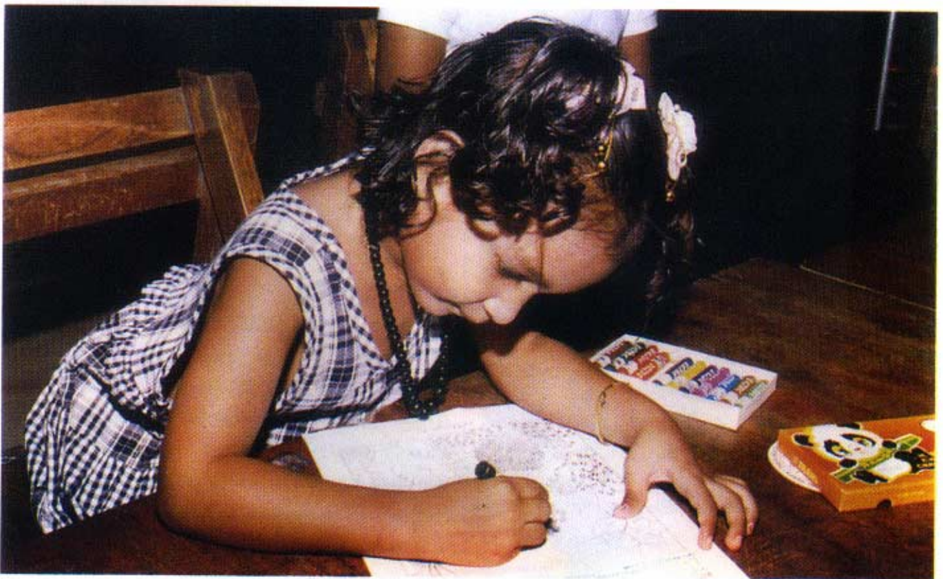
Even little children in the Maldives know how important the reef resource is – thanks to events such as colour drawing competitions organised for them.

The Ministry of Fisheries and Agriculture, in particular the