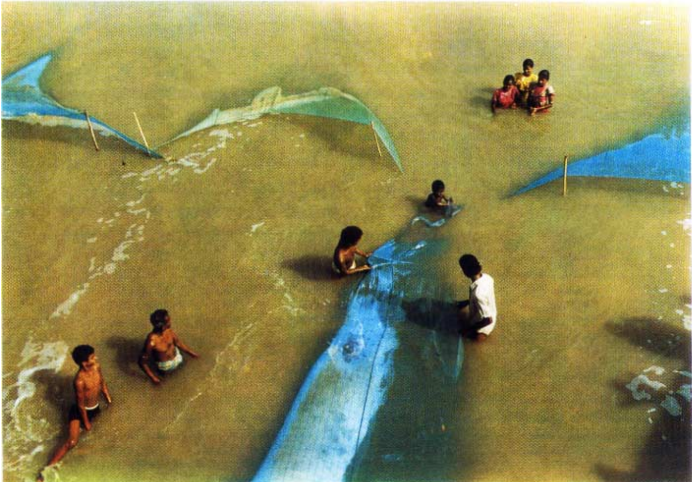
capture of shrimp fry in West Bengal, a mass activity that threatens the shrimp resource.

The use of common effluent treatment ponds and common water reservoirs is being explored to minimize pollution and disease outbreak from haphazard discharge of pond effluent. In keeping with the decision of the Supreme Court, efforts are also being mounted to turn a potentially self-polluting industry without management to a self-cleaning industry with responsible husbandry and management. For example, water will be managed as a scarce or limited input, not just as a medium to produce fish. Its value, reflecting its importance and scarcity, will be included in the cost of production of shrimp. It will no longer be regarded as a free unlimited resource. Suggestions have been made to plant mangrove seedlings along water drainage and water supply canals to help in "settling sediments and cleaning" the water discharged through mangrove roots percolation. Denuded coastal areas are being replanted, and surrogate soils brought in to replace polluted and over-used pond bottom soils, as well as other types of rehabilitation activities.