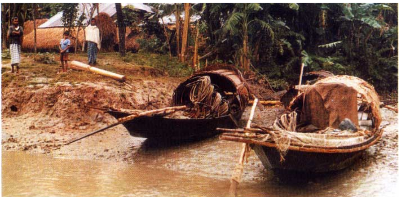
Estuarine set bagnet community in Patuakhali, Bangladesh. A BOBP pilot activity is assisting management of this fishery (Hundreds of fishermen earn their livelihood through set bagnets, but they are a resource-damaging gear.

The fishing communities themselves are acutely aware of the problems and of their own plight. When they attempt to go further off-shore to fish, they are pushed back by fishermen already there. Opportunities for gainful employment on land are few and far between. With management awareness high, these fisherfolk are ready to experiment with any management scheme that can ease their plight, including adding value. They are prepared to add value to (a) fishing boats by using them for transport (b) to their own labour, by working on farms or pulling rickshaws or taking up other occupations during their spare time (c) to fish landed, by producing boneless hilsa (d) to coastal waters, by taking up sea farming.