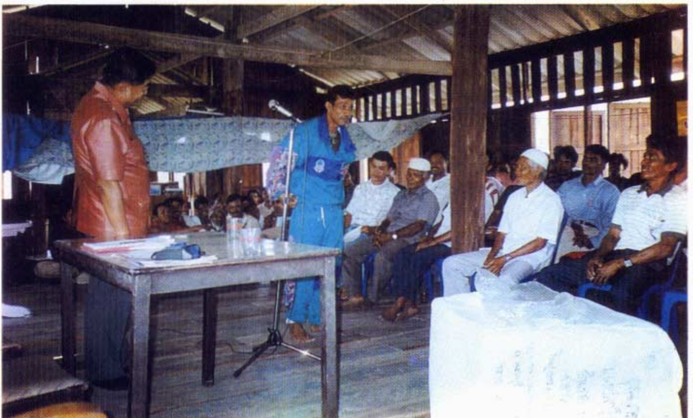
Community-based fisheries management (CBFM) in progress. A 61-monthly meeting of fisherfolk in Ban Sam Chong Tai, a village in Phang-Nga Bay, Thailand. A volunteer bay warden/sea ranger models the uniform provided by the local chamber of commerce and the trawl owners’ association.

In the end, management boils down to building awareness and participation. The emerging trends described for each country in the pages that follow, demonstrate that fishing communities are capable of assuming more and more responsibility to solve their own problems, given the confidence and the opportunity. Fisheries managers have only to elicit their involvement and participation.