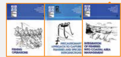
FAO Technical Guidelines for Responsible Fisheries