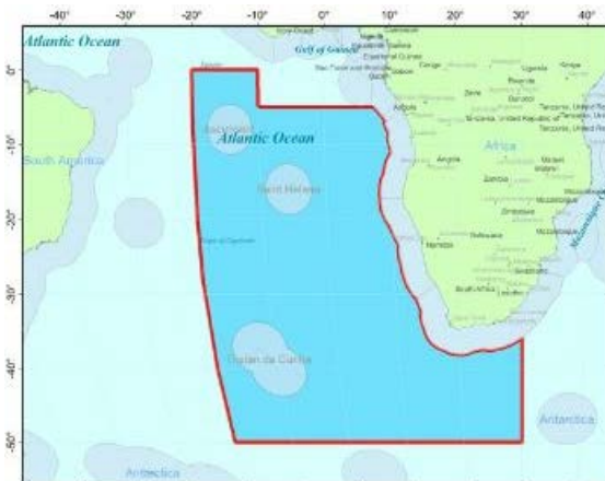
Atlantic Southeast area where fishery resources will be assessed and vulnerable marine ecosystems located. (Map: SEAFO)

Search by date Go Search by country All Go