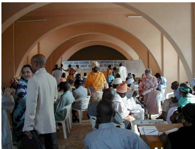
Workshop on artisanal fish trade in full session

□ The workshop was organised in Dakar, Senegal from 30 th May to 1 st June 2001 by ICSF (International Collective in Support of Fish Workers), CREDETIP (Centre de Recherche pour le Développement des Technologies Intermediaires de Peche) and CNPS (Collectif National des Pecheurs du Sénégal) with SFLP support. Participants included fish processors and traders (mainly women) from Senegal, The