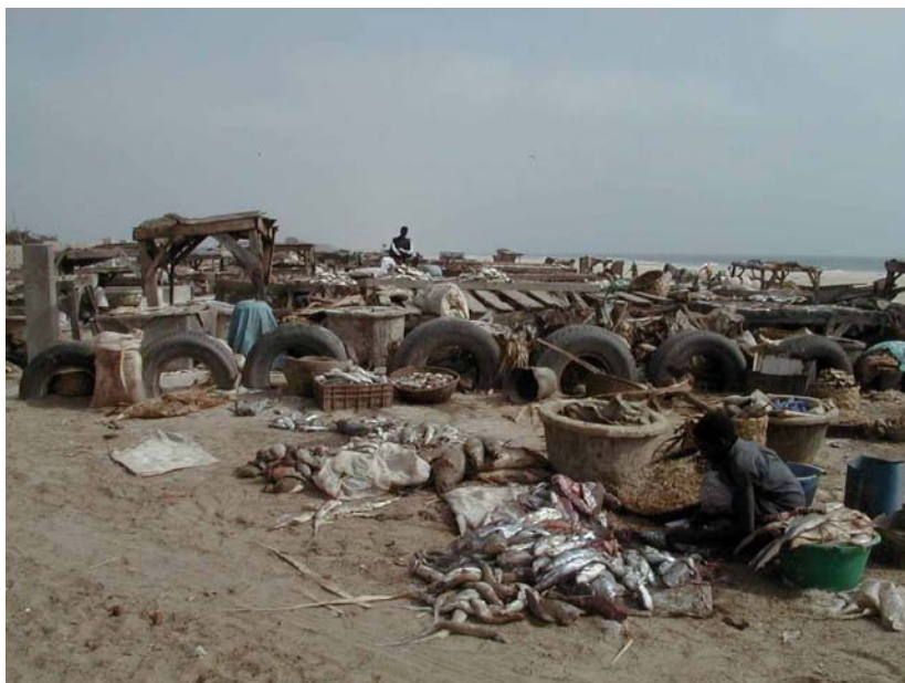
Kayar beach, a case for improving hygiene