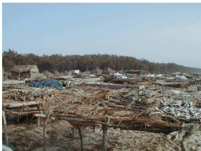
Fish drying at Lonmpoul, Senegal

6. Create appropriate credit structures to support women processors and traders, and make available credit at lower rates of interest. Women were of the view that lending institutions also have an important role to play towards this.