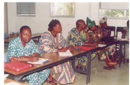
The new fish mongers Association in Benin discuss the need to establish viable partnership relationships

The activities lined up include the strengthening of organisational management and communication skills of the executive members of the bureau. An NGO has already been identified to assist the Association in the execution of the project.