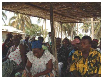
Adina fisheries community Management Committee (Ghana) identify opportunities for diversification in the community

The women of the community expressed their particular interest in livelihoods diversification opportunities in order to increase their income. During her visit, the Project Officer also discussed and provided assistance to the NCU in the reformulation of some community projects proposals.