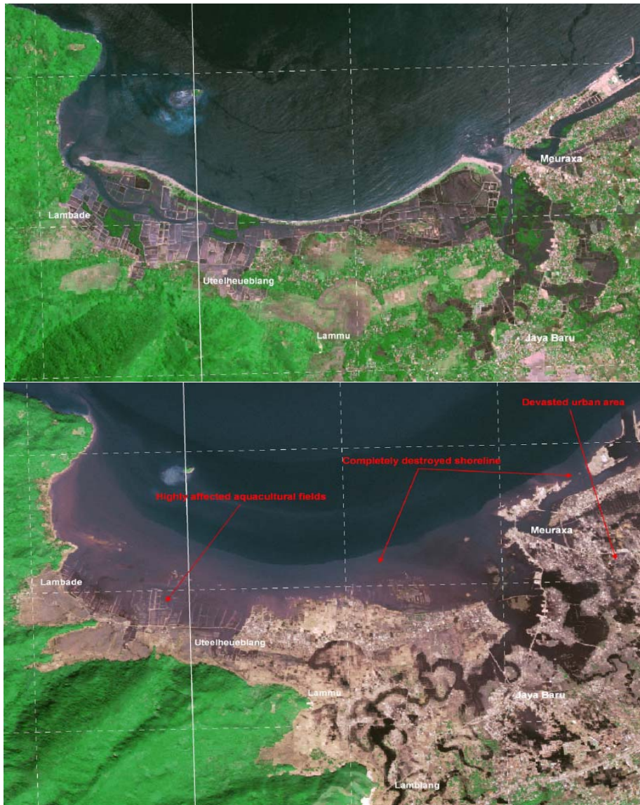
Plate 1: Before and after tsunami images of the coastline in Kota Banda Aceh, showing severe coastal damage and extensive loss of aquaculture ponds