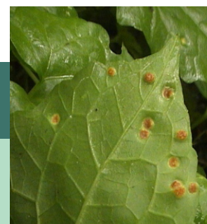
Puccinia spegazzinii - infection at released sites, Kerala, India