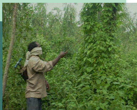
Herbicidal application on Mikania