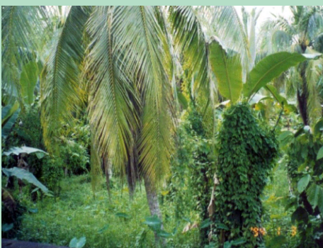
Mikania overgrowing banana