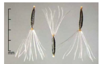
Mikania seeds bearing pappus