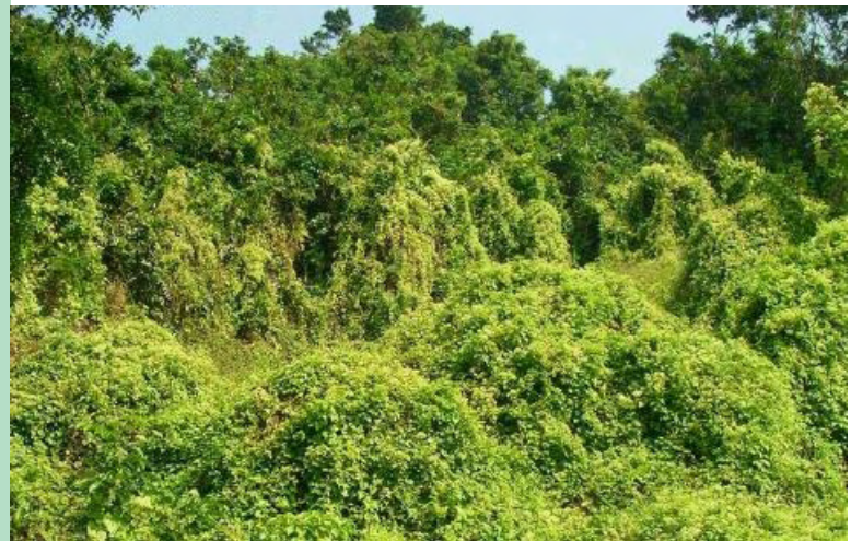
Mikania smothering vegetation in a degraded natural forest

Mode of infestation: Mikania can smother, penetrate crowns and choke and pull over plants. It thus causes a significant reduction in the growth and productivity of several crops. It successfully competes with trees and other crop plants for soil nutrients, water and sunlight. The weed can reduce light interception by covering the canopy of trees. Damage due to Mikania is high in young plantations compared to older ones since the weed can easily smother young trees. The adverse effect of Mikania on crops and soil properties is through the production of phenolic and flavanoid compounds.