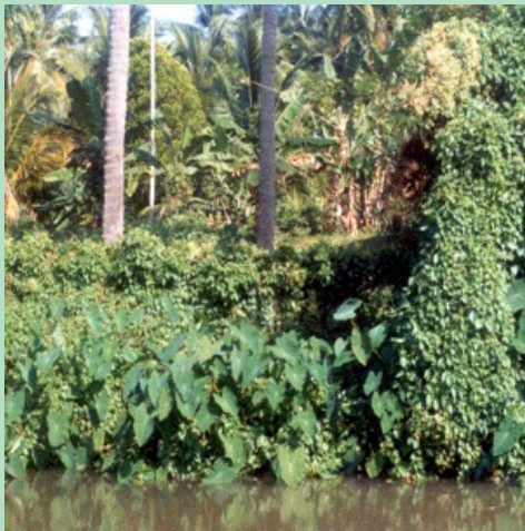
Mikania growing along the banks of water bodies

Seed dispersal: Seeds are dispersed over long distances by wind, animals and water currents. The germination percentage of seeds is very low (8-12%) compared to other weedy species. Light, water, soil nutrients and fire affect the germination of seeds. The main mode of propagation is vegetative.