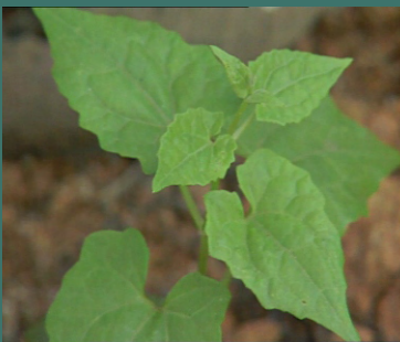
Seedling of Mikania