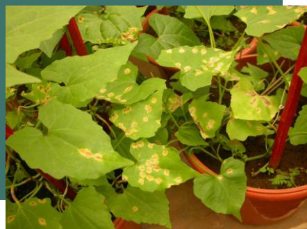
Leaf and petiole infection on Mikania caused by Puccinia spegazzinii

Biological : Biological control using a natural insect enemy, viz., Liothrips mikaniae from Trinidad, was attempted in the Solomon Islands and Malaysia but successful establishment was not achieved. Recent studies carried out by CABI Bioscience (UK) in collaboration with Kerala Forest Research Institute (India) and institutions under the Indian Council of Agricultural Research have shown that a highly damaging microcyclic rust, viz., Puccinia spegazzinii , which naturally occurs and causes damage to Mikania in the neotropics, has great potential as a biocontrol agent against the weed. The fungus was tested for host specificity against closely related members of Asteraceae and a number of economically important plants and proved highly specific to Mikania. It was released recently in tea plantations in northeast India and agricultural systems in southwest India and preliminary results on spread of the pathogen in the field has been encouraging.