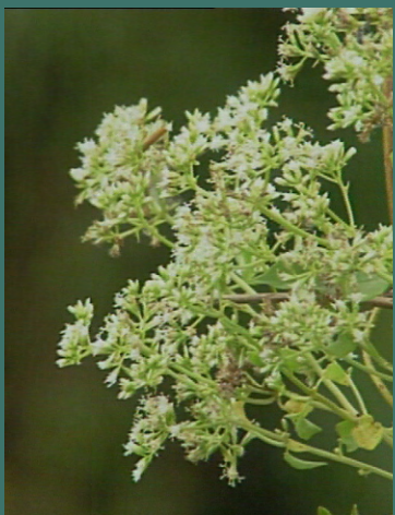
Branches with inflorescence