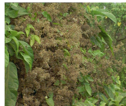
Mikania vine with mature seeds

Habit: It is a perennial twining herb with 5-ribbed branches, pubescent or glabrous; internodes are 7.5 - 21.5 cm long. Leaves are opposite, ovate-deltoid, 6 - 15 x 3 - 9 cm, base cordate, apex acuminate, margins are coarsely dentate, crenate or sub-entire, glabrous on both sides, minutely glandular beneath and 3 - 5 nerved from the base; the petiole is 3 - 7 cm long. The inflorescence is axillary paniced corymbs; capitula is cylindrical, 1.5 mm across; there are 4 flowers per capitula; 4 involuclral bracts, oblong to obovate, acute, green in colour, 1 - 3 mm long with a fifth smaller one that is 1 - 2 mm long; the corolla is 5 - lobed, white, often with a purple tinge, 4 - 5 mm long; achenes 2 - 3 mm long, narrowly oblong, 4 - angled, black, glabrous; pappus capillary, uniseriate, connate at base, 3 mm long, white at first, becoming reddish-brown. In south - west India, flowering starts in August and continues up to January. Fruit setting occurs between September and February, initiated 17 - 21 days after flowering. A single stalk of mikania can produce 20,000 - 40,000 mature seeds in one season. Seeds are minute and bear pappus; dispersal of the seeds occurs between October and April. The mean number of seeds per mg is 108 \pm 12 . The plants can grow vegetatively from the nodes and very small segments of the stem. Growth of young plants is extremely fast (8 - 9 cm in 24 h) and, using trees as support, the weed rapidly forms a dense cover over entangled leafy stems.