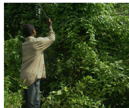
Sickle weeding of Mikania

Uses: Economic gains due to Mikania are meager compared to the loss due to its infestation in various ecosystems. It is used as a fodder in many countries. Sheep preferentially grazed Mikania in Malaysia and other cattle also relish it. In Kerala, India, the weed is utilized as a fodder in some parts of the state, especially during summer when availability of grass is scarce. However, Mikania is known to cause hepatotoxicity and liver damage in dairy cattle. The antibacterial effect of Mikania and its efficacy in wound healing has been reported. In Assam (NE India), Kabi tribes use the leaf juice of Mikania as an antidote for insect bite and scorpion sting. The leaves are also used for treating stomachache. Use of juice of Mikania as a curative agent for itches is reported from Malaysia. However, in all such cases therapeutic evidences are scarce or lacking. In Africa, Mikania leaves are used as a vegetable for making soups. The weed is used as a cover crop in rubber plantations in Malaysia. It is also planted on slopes to prevent soil erosion. Mikania green manure has been reported to increase the yield of rice in Mizoram, India. Recent studies have shown that Mikania is not suitable for mulching and composting due to its high water content.