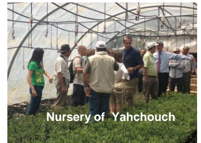
Nursery of Yahchouch

The second stop was in the village of Yahchouch. In this village participants had the opportunity to visit one of the three nurseries of APJM dedicated to production of local species (some are endemic). This initiative aims to produce plants of local trees for reforestation at the regional level while providing local incomes through jobs related to the management of the nursery.