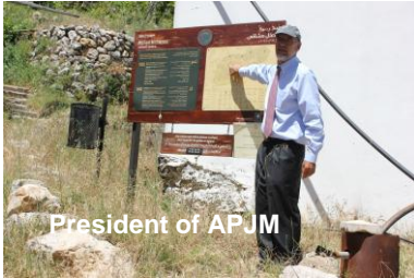
President of APJM

The Second Steering Committee of the project "Maximize the production of goods and services of Mediterranean forest ecosystems in the context of global changes", funded by FFEM (French Global Environment Facility), was held in Beirut from 04 to 06 June 2013.