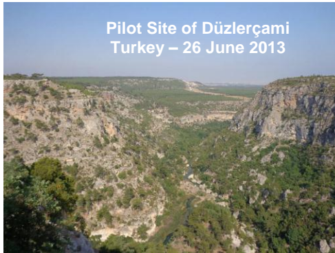
Pilot Site of Düzlerçami Turkey – 26 June 2013

Plan Bleu organized from 25 to 27 June 2013 in Antalya (Turkey) a workshop on participatory governance approaches in order to share experiences and identify relevant methodologies for the implementation of participatory approaches in forest landscapes in the Southern and Eastern Mediterranean.