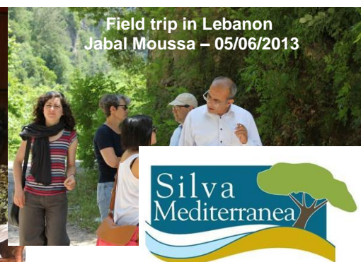
Field trip in Lebanon Jabal Moussa – 05/06/2013