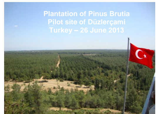
Plantation of Pinus Brutia Pilot site of Düzlerçami Turkey – 26 June 2013

Representatives from each country presented the situation of governance on the pilot sites and, following a work of reflection fed by the methodological recommendations and related discussions, defined first outlines of the participatory approach to be implemented on their pilot sites: purpose, operational objectives and synergies, stakeholders, roles and responsibilities, process, methods and tools.