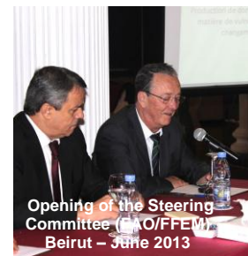
Opening of the Steering Committee (FAO/FFEM) Beirut - June 2013

I would like to conclude this editorial by thanking the representatives of the French Global Environment Facility for the significant financial support (2.65 million Euros) given to Southern and Eastern Mediterranean partners to maximize production of goods and services in our Mediterranean forest ecosystems. I am convinced that the good dynamic created since the launch of the project in September 2012 in Rome will allow us to produce relevant results to ensure sustainable management of mediterranean forested landscapes in the context of global changes.