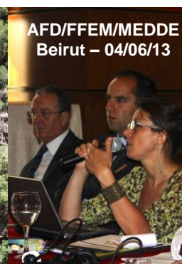
AFD/FFEM/MEDDE Beirut – 04/06/13