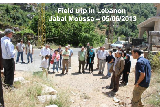
Field trip in Lebanon Jabal Moussa – 05/06/2013