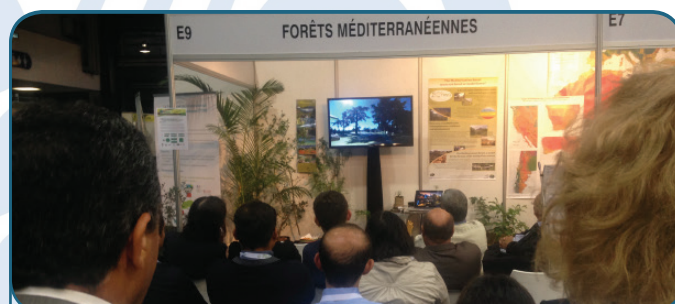
The Mediterranean booth XIV WFC - 2015 Durban, South Africa

Among the initiative of the booth a cocktail was organized to launch the video “The potential of Mediterranean Forests in the context of climate change” filmed in two target countries of the project: Lebanon and Morocco and based on the results of the French Global Environment Facility (FFEM) regional project “Maximize the production of goods and services of Mediterranean forest ecosystems in the context of global changes” (Eng. https://vimeo.com/144617407 ; Fr. https://vimeo.com/144125959 ). The Mediterranean booth was a great success and Silva Mediterranea would like to thank all the colleagues involved in this initiative with the hope to keep up the good work in increasing Mediterranean forests visibility in many more future events.