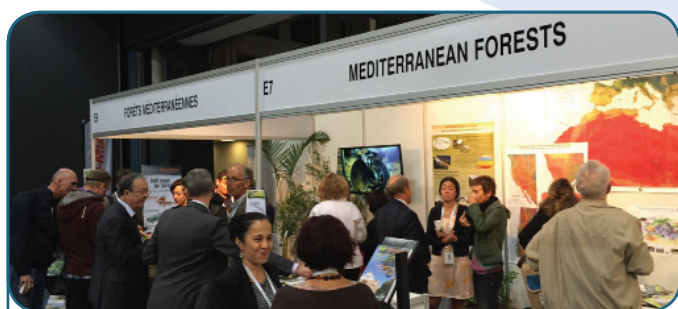
The Mediterranean booth XIV WFC - 2015 Durban, South Africa

Our experience at the XIV World Forestry Congress, held in Durban from September 7 to 11, 2015 was rich and stimulating and it will mark our profession as young foresters for the rest of our lives. The stand dedicated to Mediterranean forests in the congress area offered a great opportunity to the representatives of various countries in the region to promote their products, innovations and efforts related to forests. At the same time, it has helped building new links between Mediterranean forest and other actors in the forestry sector all over the world. Visiting other booths was a trip around the world with an incredible diversity of products and faces, but despite our differences and distinctions, a friendly atmosphere has gathered us all. This is the global forest family that challenges all difficulties to conserve our forest wealth and preserve the living conditions of the communities that depend on them.