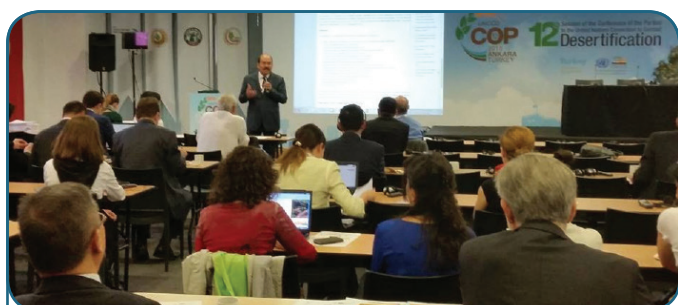
Workshop on Desertification and Restoration in Mediterranean Drylands - 2015 Ankara, Turkey