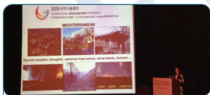
Working group on forest fires of Silva Mediterranea - 2015 Pyeongchang, Republic of Korea

In the Mediterranean region, wildfire destroys the protective and productive roles of forests and forested areas, generating soil erosion and desertification problems and reducing water retention, which are both very important functions needed to preserve Mediterranean ecosystems. Armed conflicts in the Mediterranean are raising new challenges related to wildfire management and control. The use of fire as part of conflict strategies affects valuable Mediterranean forests and forestry lands as well as populations and refugees.