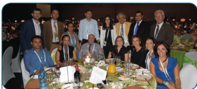
The Mediterranean team XIV WFC - 2015 Durban, South Africa

The World Forestry Congress in Durban was the opportunity to interact with students, researchers and professionals from diverse backgrounds, who have shown a real interest in Mediterranean forests and particularly in the Moroccan forests. It was a genuine opening to the world, this rewarding experience, both personally and professionally, has allowed us to make interesting meetings with visitors and with colleagues experiencing the same problems than Moroccan foresters, actively involved in the preservation of the Mediterranean natural heritage.