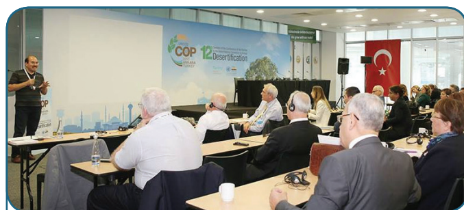
Workshop on Desertification and Restoration in Mediterranean Drylands - 2015 Ankara, Turkey @I. Belen

Forest and Landscape Restoration (FLR) is being increasingly recognized for its potential to reverse land degradation processes. Countries have started to engage in global commitments to restore degraded lands, such as with the Bonn Challenge, a global aspiration to restore 150 million hectares by 2020. Efforts are also being made at the regional level, for example through the Initiative 20x20, aiming to bring 20 million hectares of degraded land in Latin America and the Caribbean into restoration by 2020.