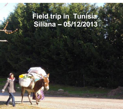
Field trip in Tunisia Siliana – 05/12/2013