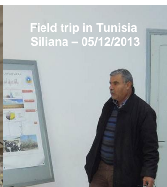
Field trip in Tunisia Siliana – 05/12/2013