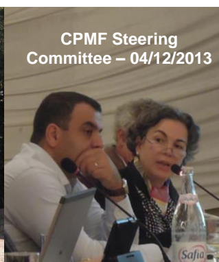
CPMF Steering Committee – 04/12/2013