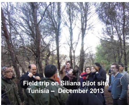
Field trip on Siliana pilot site Tunisia – December 2013

The last stop was a visit in the forest of Siliana which represents a total area of about 140,000 hectares with mainly populations of Aleppo pines, Maquis, Garrigues and rosemary.