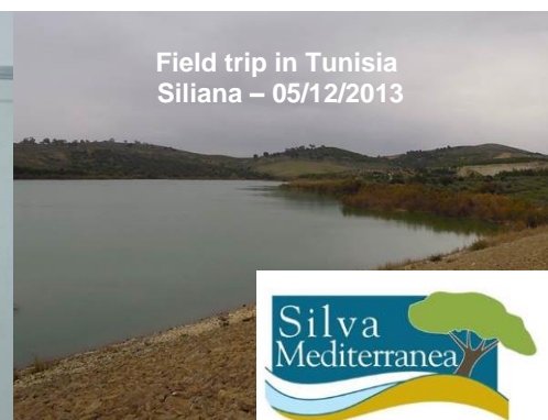
Field trip in Tunisia Siliana – 05/12/2013