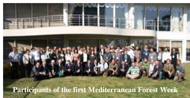
Participants of the first Mediterranean Forest Week