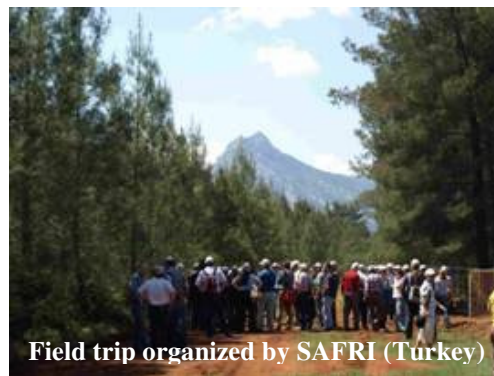
Field trip organized by SAFRI (Turkey)