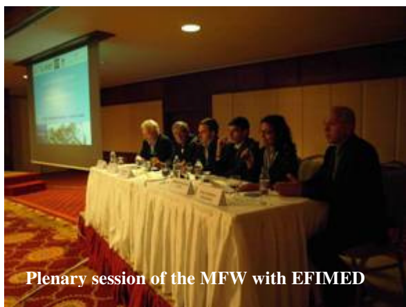
Plenary session of the MFW with EFIMED