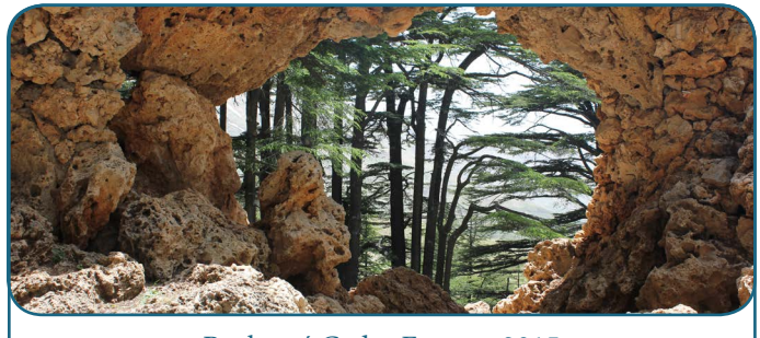
Becharré Cedar Forest - 2015 North Lebanon, Lebanon

Following the example of several commitments taken on a global or regional level through various current initiatives (Bonn Challenge, the 20x20 Initiative in Latin America, the AFR100 "African Forest Landscape Restoration Initiative" in Sub-Saharan Africa, the Ankara initiative to