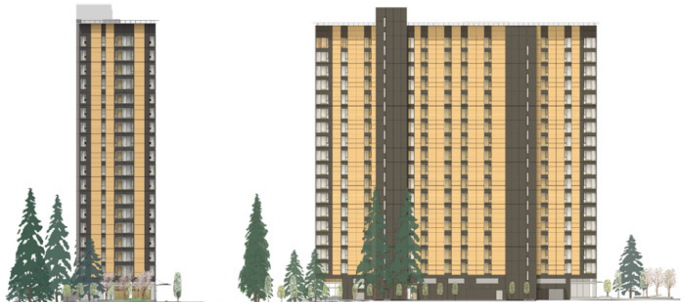
© Acton Ostry Architects and the University of British Columbia

The aim of the initiative was to showcase the applicability, feasibility and environmental benefits of innovative wood-based solutions to large buildings over 10 storeys. A wealth of technical information from research funded through the initiative is being used to support proposed changes to Canadian building codes for 2020.