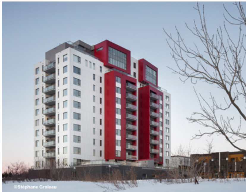
Finalized residential 13 storeyed woodframed building "Origine" in Quebec City

but no legislation has been passed. Despite this, there is an increasing share of tall timber buildings. The corporate sector (in particular technology companies) is using tall timber as it commits to increasing sustainability.