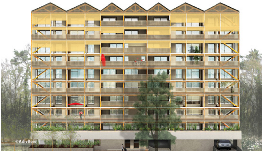
“Capable” building in Nantes-Saint-Herblain