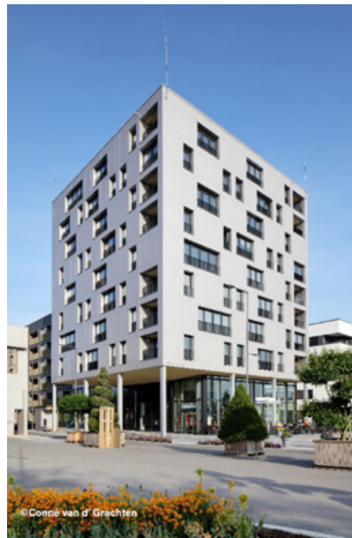
Germany's tallest wooden multi-storey building in Heilbronn

The German Government does not unilaterally promote any specific building material, but promotes wood as a climate- and environmentally-friendly resource through programmes and projects, awareness raising and the provision of consumer information (Deutscher Bundestag, 2013).