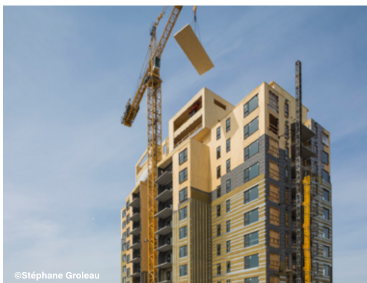
Building “Condos Origine”, Québec city, 2017. First wood-based 13 storey building in Eastern-North-America. Winner of Québec Cécobois 2019 wood construction prize. Multiresidential use