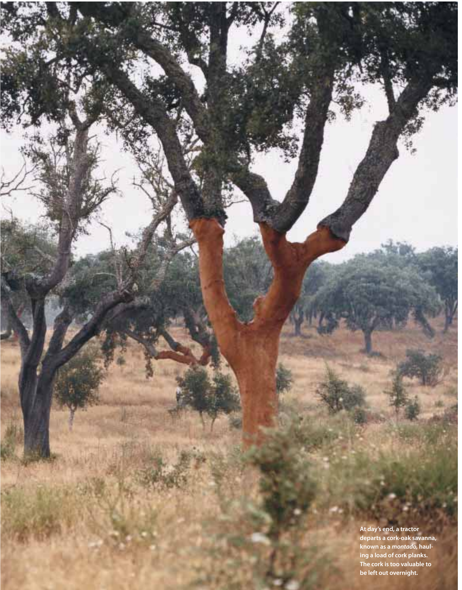
At day's end, a tractor departs a cork-oak savanna, known as a montado , haul- ing a load of cork planks. The cork is too valuable to be left out overnight.