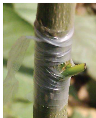
Figure 2. Grafted bud for making stem cutting

harvested and there were no clonal differences of root stock or scion on growth and yield of trees. The technique is also used to rejuvenate old trees by serial propagation to induct them first time in production system.