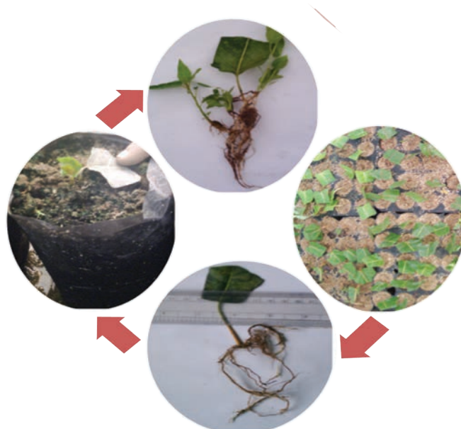
Figure 3. Propagation through leaf cuttings

In general, the vegetative propagation of poplars is easy. Vegetative means that have been used for the reproduction of poplars in India are coppicing, the use of stem cuttings (from single bud short cuttings to multiple bud standard cuttings 8–9 inches in length; tender, semi hard and hard wood cuttings), root cuttings, root + stem cuttings, bud sprouts, leaf cuttings, grafting, budding, stem cuttings with budded scions, layering, and tissue culture. Each is a significant way of propagating poplars in commercial production, improvement and other scientific works. Of the three methods summarized above, the first two are operationally applied for mass multiplication, depending on species and purpose for propagation. The third – the use of leaf cuttings – is still experimental. The percentage of plants produced in proportion to the planted cuttings is highest in root cuttings, followed by stem cuttings and leaf cuttings. P. deltoides is the main planted poplar, and its two dozen cultivars form the bulk of plantations (up to 99%). Many are mass multiplied to built up stock to meet sudden demand for selected cultivars from growers and for the rejuvenation of mature trees. ■