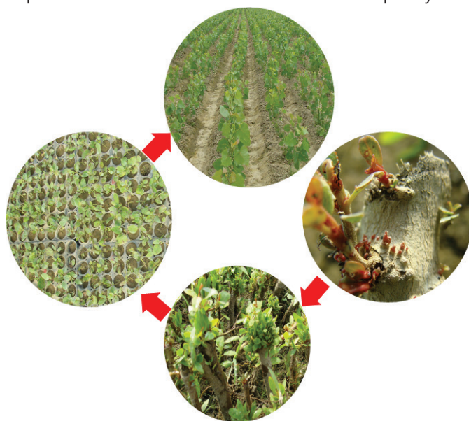
Figure 1. Propagation from root sprouts

be multiplied to around 1 000 plants from its root sprouts. This technique is invariably used to built up an inventory of cultivars with depleting stock and to replace old mixed stock to maintain clonal purity.