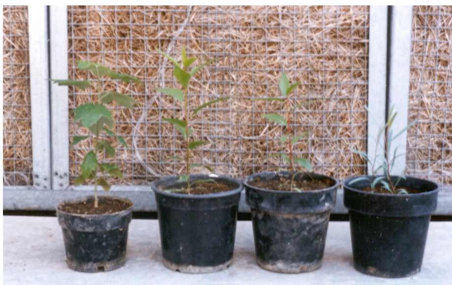
Fig.2: Performance of 4 years old Populus euphratica oliv. x P. alba L. Var. " Mofid" (Right), Populus alba L. as control (middle) and Populus alba L. x P. euphratica Oliv. in adaptation study ( Orimiyeah ),

Due to occurrence of unusual cold temperature (less than -45oC in 1383, burning of apical bud has been observed in Populus euphratica oliv. x P. alba L. trees. Therefore cold conditions are a limitation factor for Populus euphratica oliv. x P. alba L. and cannot be suggested for poplar plantation in this area.