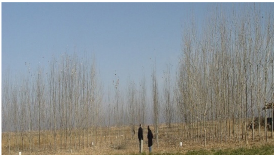
Fig.1: Phenotypical performance of Populus euphratica Oliv. × P. alba L. Var. " Mofid" hybrid (Middle) with its parents . Right= Populus euphratica Oliv. (Female parent) Left= Populus alba L. (Male parent)

Proliferation of Populus euphratica Oliv. × P. alba L. hybrid plants took place in 1999-2000 through method of tetrad for adaptation studies in three different provinces (Khuzestan, Chaharmahal –o- Bakhtiari and Orumiya).