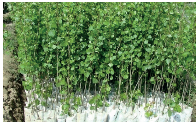
Fig.1: Top left- Conditioning of saplings in fresh water for autumn planting; Top right- Fresh plantation demonstrated to IPC delegates on 2nd Nov., 2012; Below left- Plantation photographed in first week of June, 2013 that was established on 28th Oct., 2012 in presence of IPC delegates in Yamunanagar, Haryana; and Bottom right- Saplings in polythene containers maintained for spring/summer planting