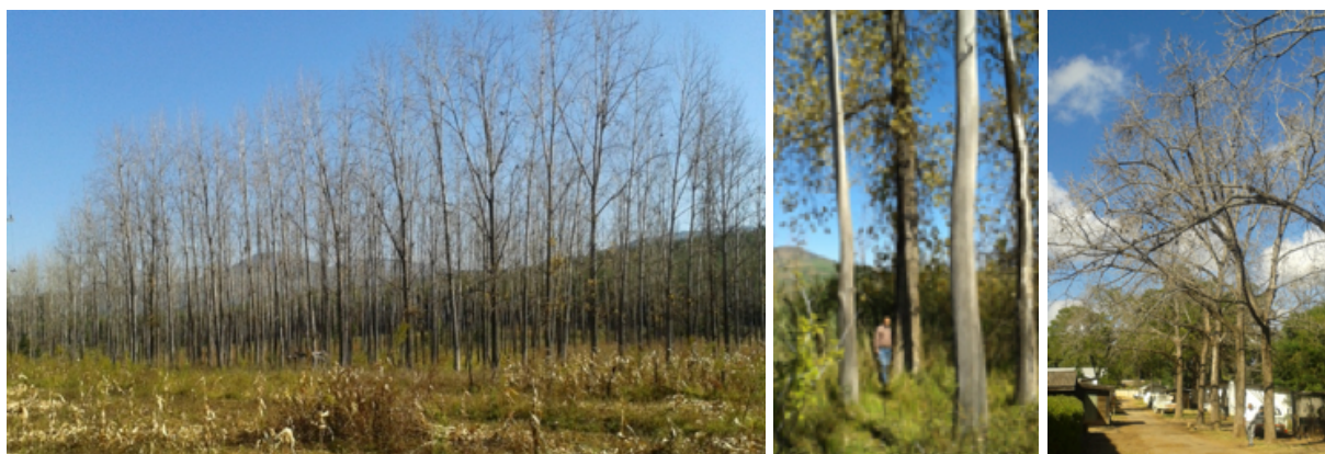
Plate-I. Left(A)- Poplar plantation in the Charter Estate of Border Timber, Chimanimani District-reportedly planted during 1989; Centre(B)- Trees near water source grew to large dimensions, others away from hydromorphic sites are dying/drying; Right(C)- Around three dozen surviving trees planted during 1975 on upland in the Estate of Forestry Commission, Harare.

This type has the largest population among existing trees/plantations in the country (Plate-III). It has been located in number of locations those include, Spot No. 2, 4, 8, 9. In Harare city, it has been planted as ornamental tree around some houses. At spot No. 9, it covers around 10 ha area along