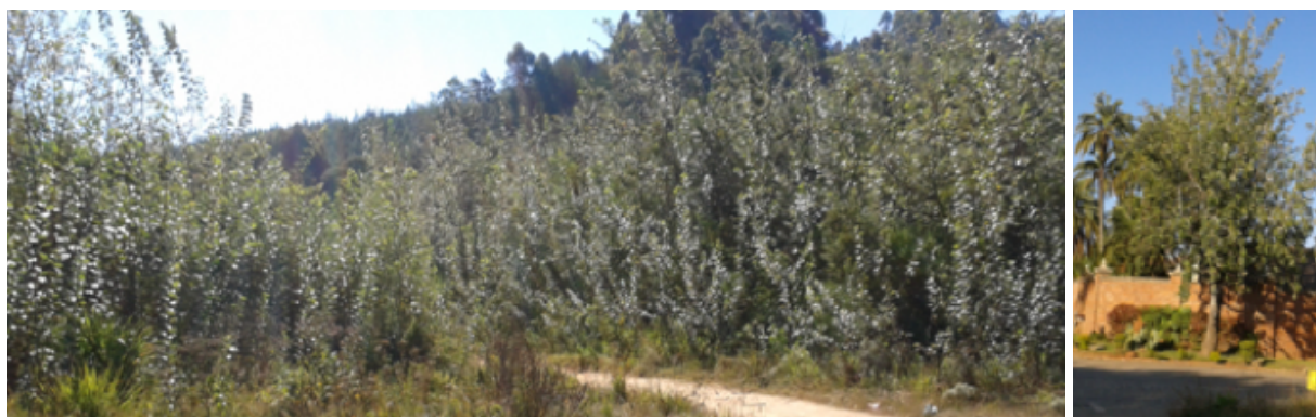
Plate-III. Left(A)- P. alba / P. x canescens at Stapleford Estate of Allied Timbers (Spot-); Right(B)- P. alba / P. x canescens on road side in Harare city.

the river bed around the Stapleford Estate. The trees/bushes of this type were in foliage in all the visited sites. The species here and in many other locations has become invasive. This type represents P. alba and/or P. x canescens and the earlier three types were of P. deltoides or its hybrids with other species.