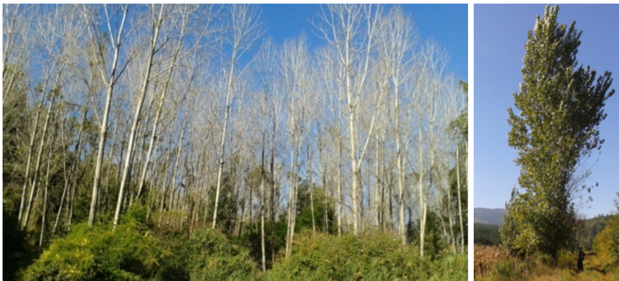
Plate-II. Left(A): A good growing stand (Spot No. 2); Right(B)- Tree with lush green foliage at Spot No. 4.