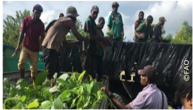
Distribution of cocoa pod borer tolerant seedling

The project steering committee for the Support to Rural Entrepreneurship, Investment and Trade in Papua New Guinea (STREIT PNG) programme held its inaugural meeting at the Department of Agriculture and Livestock office in Waigani. National senior representatives from the participating government agencies and key partners attended the meeting. The PSC will oversee the overall direction and progress of the programme in delivering on improved and sustainable economic development through a value chains approach and focused on cocoa, vanilla and fisheries.