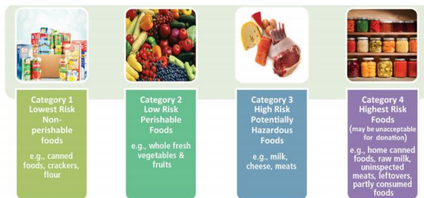
Food risk categories 29

This first research could highlight the need to develop a stronger evidence base on FLW in the country.