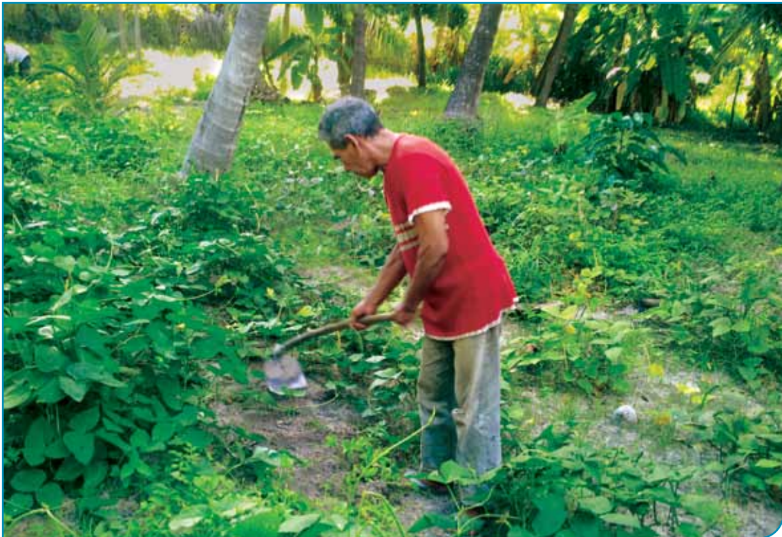
Above: Passionfruit grower in Brazil inspecting his fruit for pests or disease. Below: Smallholder farmer in Brazil removing weeds from his cowpea fields.