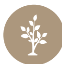
Routine and preventive vaccination prevents animal disease outbreaks