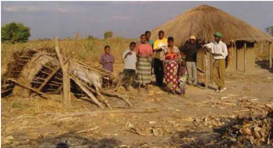
Storage bins damaged by elephants