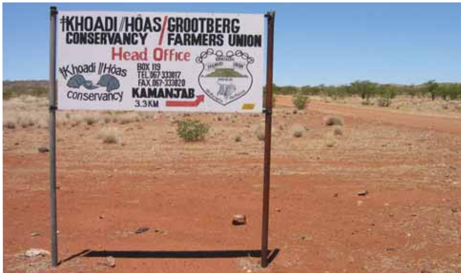
Safari hunting is a means of providing indirect compensation for human-wildlife conflict