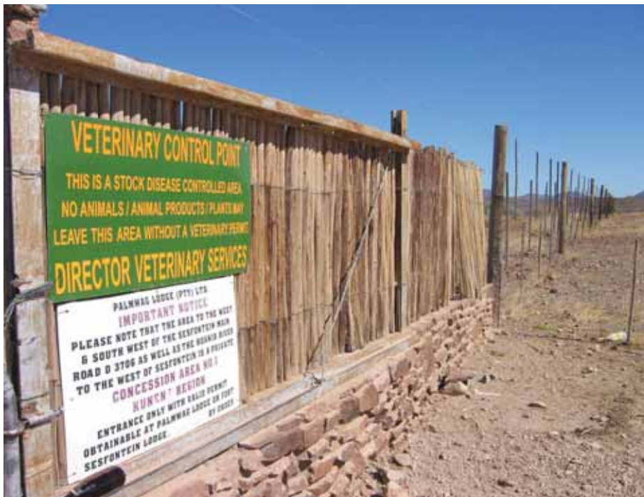
FOUNDATION IGFH, BOULET

Conservation of wildlife outside protected areas cannot be achieved merely by protecting animals and avoiding the issues of people's needs and rights and their conflict with wildlife. Human-wildlife conflict, rural poverty and hunger, the prohibitive costs of wildlife law-enforcement arising from land use practices; all severely limit wildlife conservation outside Africa's national parks. The following example perfectly illustrates a situation that is common today. In Cameroon, in the area around Bénoué National Park, wildlife is causing major damage to crops and livestock, especially staple food crops. As a result people are attempting to