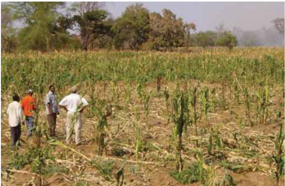
Elephants can destroy a field in a single night

Primates cause widespread damage to plantations of exotic trees by stripping away bark (Box 3). Baboons and vervet monkeys are also highly skilled at raiding