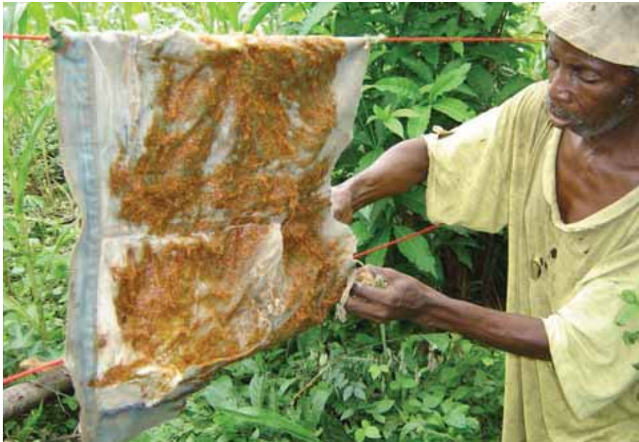
Capsaicin resin extracted from chilli peppers, which causes an extremely unpleasant irritation and burning, is the most effective and widespread repellent for elephants

as a game repellent in Scandinavia, had a certain deterrent effect on elephants. Tests show that elephants failed to cross a line of REVIRA granules placed around a field. This chemical barrier could work for up to a month or more (Hanks, 2006).