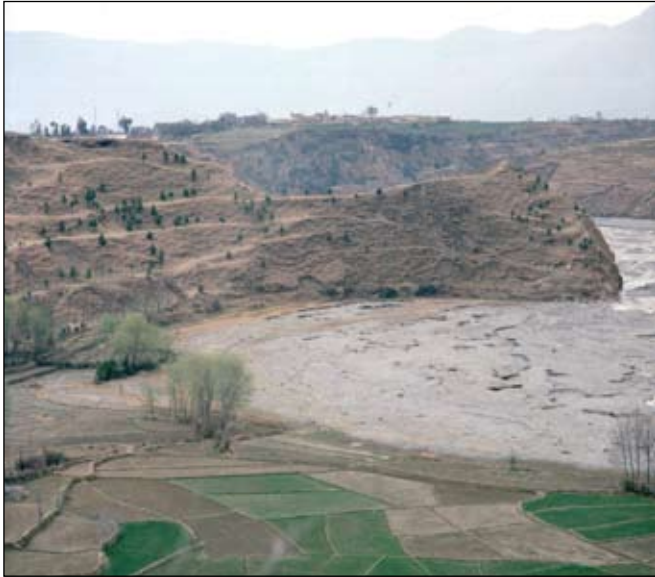
Forests maintain high water quality by minimizing soil erosion and reducing sediment; deforestation generally increases erosion, resulting in higher sediment concentration in runoff and siltation of watercourses (Pakistan)