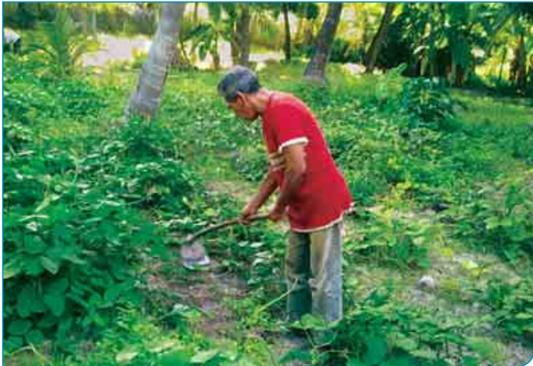
Above: Passionfruit grower in Brazil inspecting his fruit for pests or disease. Below: Smallholder farmer in Brazil removing weeds from his cowpea fields.