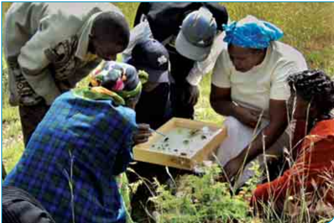
Below: Kenyan farmers learn about the diversity of insects visiting and pollinating their crops.