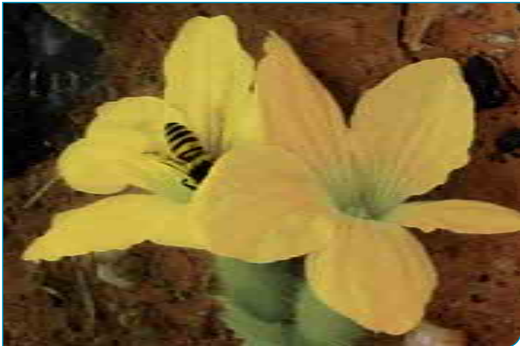
Above: Pumpkin and marrow crops in North and South America are pollinated by specialist wild bees, called "squash bees". Below: Melons, along with other cucurbit crops like pumpkin and marrows, are completely dependent on animal pollinators – such as this honey bee in Brazil – to produce fruit.