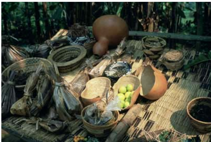
A variety of herbs used by the Bwindi communities

A handicraft development expert, involved in exporting crafts from Uganda and experienced in training handicraft groups, was recruited to carry out a feasibility study of the handicraft workshop in Buhoma. He concluded that local natural resources could be used sustainably to make new products (e.g., baskets, place mats, wood carvings and paper products) based on existing traditional artisanal skills, and that these could be sold successfully locally (mainly to tourists) and in Kampala. The handicraft workshop would generate income for local artisans in two ways: as a handicraft selling point in Buhoma, and as a workplace where tourists would pay fees to observe how local crafts are made. A small garden with examples of plants used to make natural dyes would add to the attraction for tourists.