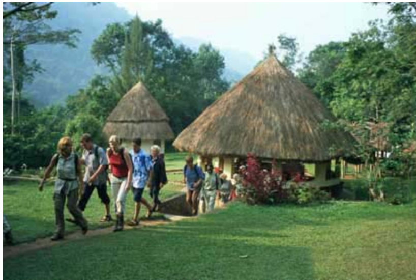
Tourists set off on the walk from the Buhoma Rest Camp

community-based tourism activities officially, launched the village walk at an opening ceremony in December.