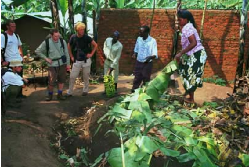
A woman shows tourists how to prepare a local drink made from fermented banana juice

Based on the feasibility studies carried out in phase 2, it was decided to focus the project's limited resources on developing one good tourism product – the Buhoma village walk. Bird watching sites and the handicraft workshop were incorporated as sites on the walk. A village walk enterprise group was created; this is composed of eight guides selected from the local community according to set criteria, and a number of site owners, i.e. households that manage the sites where tourists stop. For example, one household was selected to show tourists how local drinks are made from banana trees, and another was selected to show tourists how local traditional herbal medicines are collected and prepared.