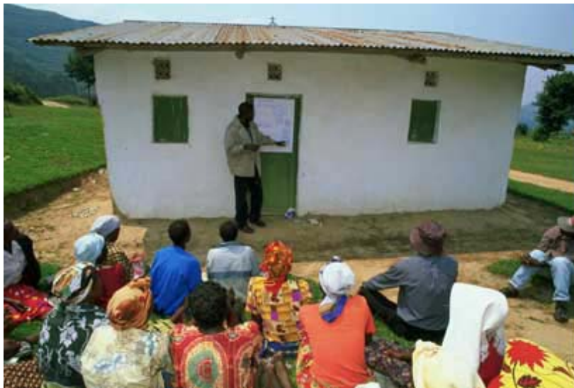
Workshop to discuss the opportunities and constraints of potential community-based tourism activities in Buhoma

A meeting of representatives from Nkwenda and Mukono was held in October 2001 to brainstorm ideas for possible community-based tourism enterprises that use the existing natural and cultural attractions of the area. These ideas were then combined with information provided by MBIFCT and FAO staff on types of tourism activities developed in other countries that could be replicated in Bwindi.